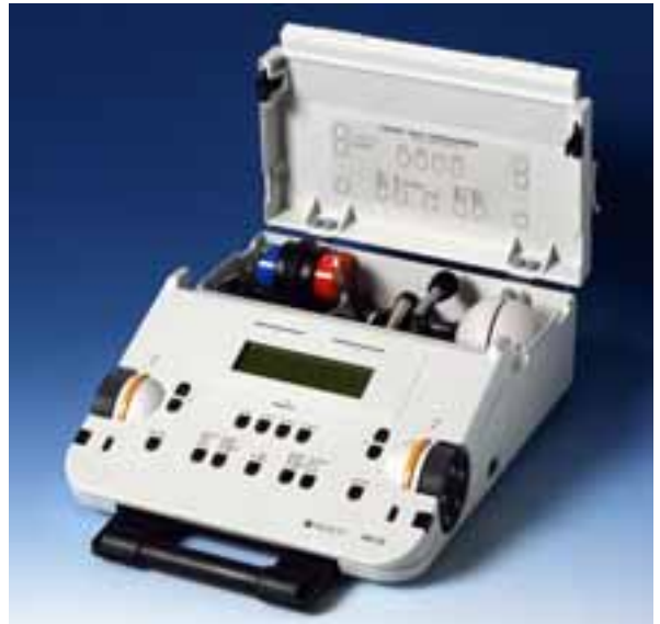
MA 53 with accessories in integral carrying case

The MA 53 offers high tone audiometry with AC and BC for advanced diagnostics.