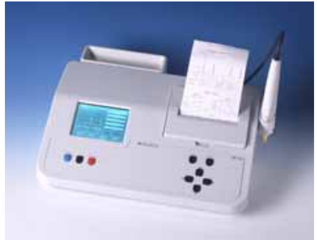
MI 24 with optional connector cover

The impedance test starts automatically. The intensity of the four frequencies of the following reflex test is increased automatically until a reflex is detected or the maximum is reached. The maximum level is adjustable to protect sensitive ears. An automatic printout of the test results can be selected.